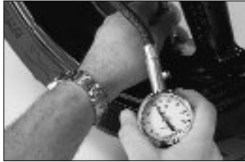
Dunlop recommends using a gauge that holds the pressure reading.

Overinflating tires does not increase load-carrying capacity, but will result in a hard ride and accelerated tire wear in the center of the contact patch.